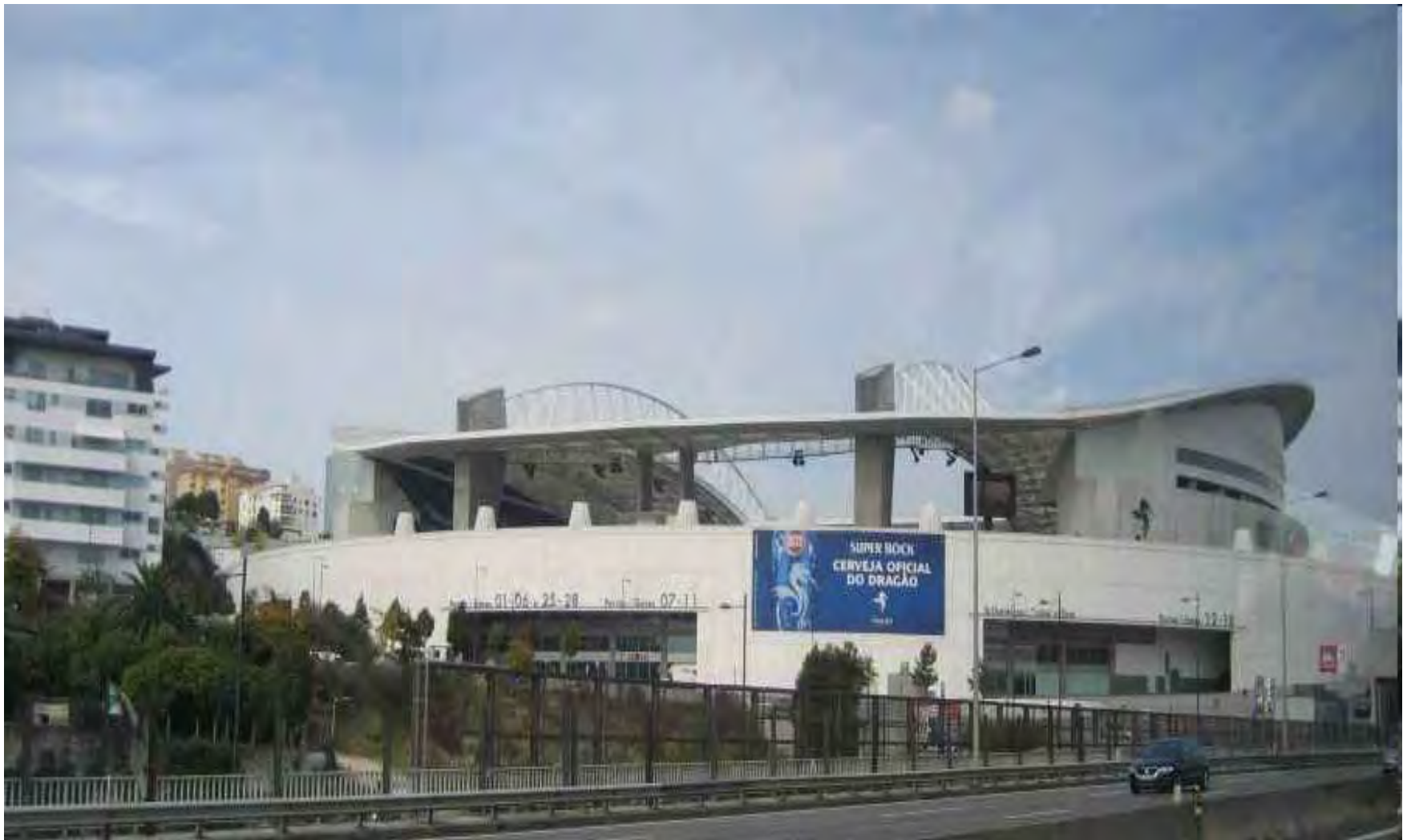
The football stadium in Porto.