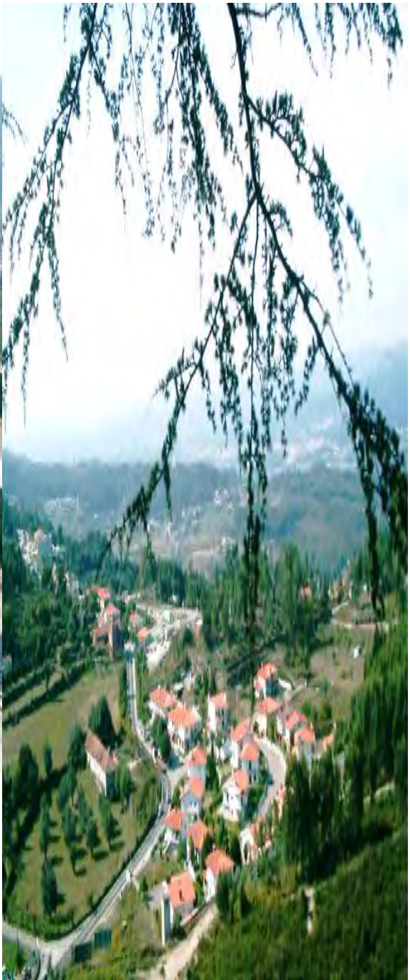
Monday, 26th September We visited a castle and a local church.