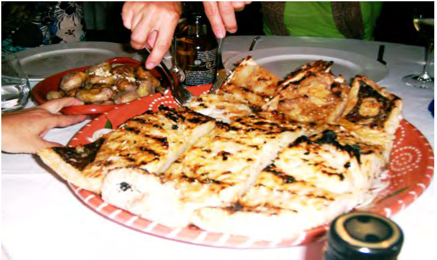
BACALHAU: traditional meal made of cod fish